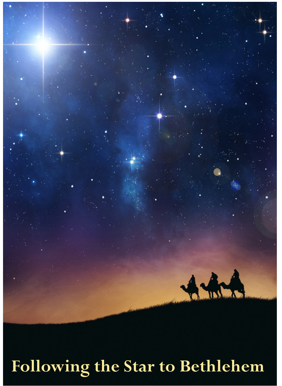
Following the Star to Bethlehem